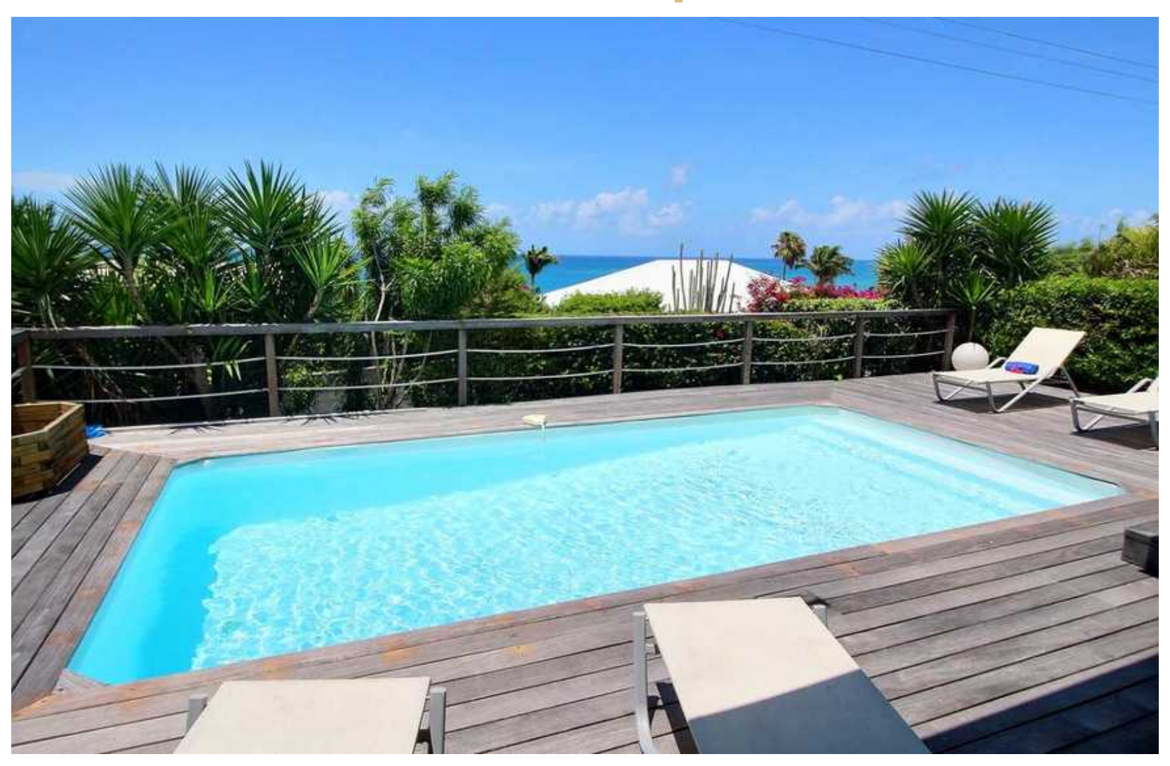
From 228.57 € / night - 3 bedroom(s) - 2 bathroom(s)