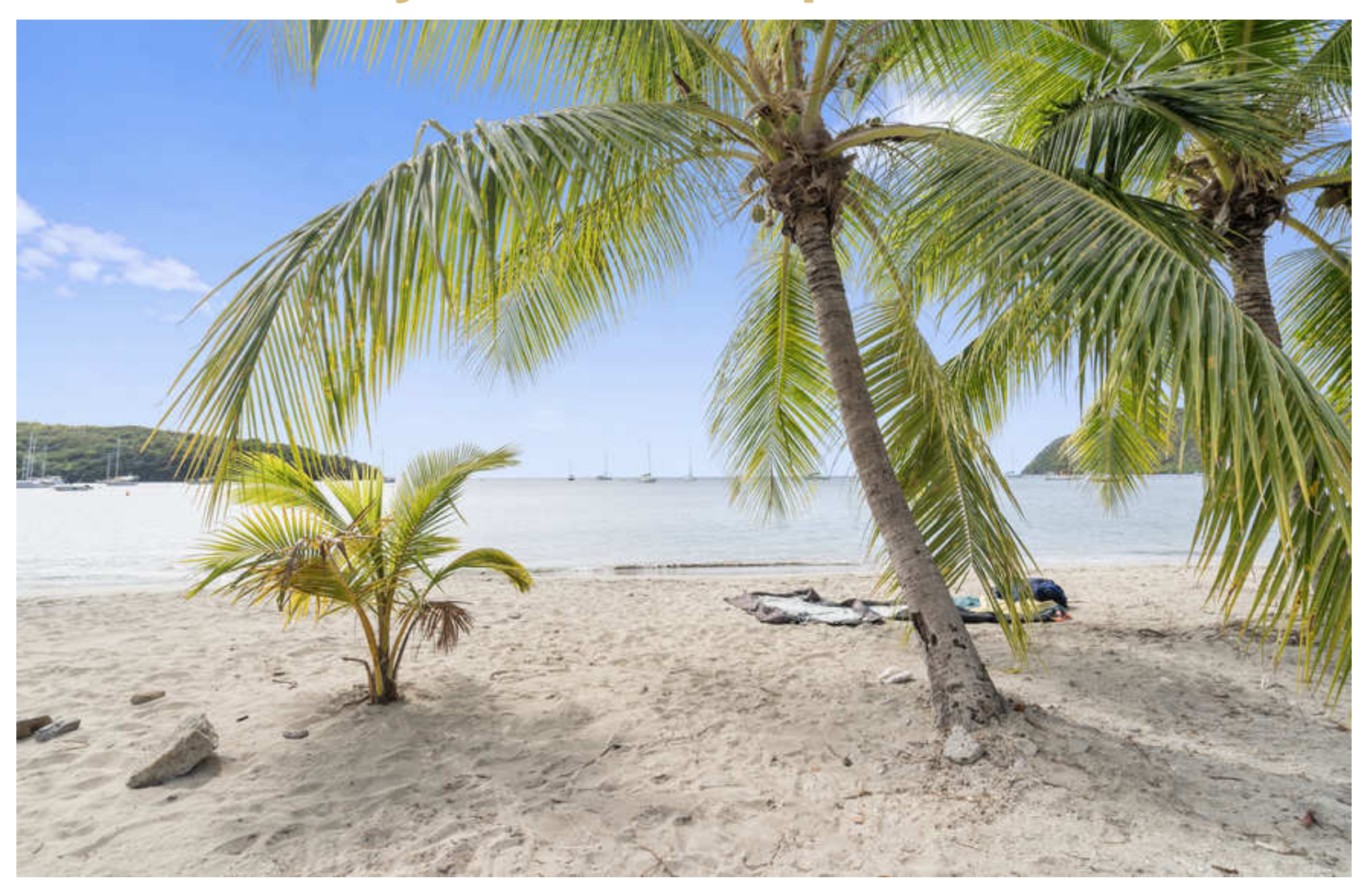
From 140.0 € / night - 2 bedroom(s) - 1 bathroom(s)