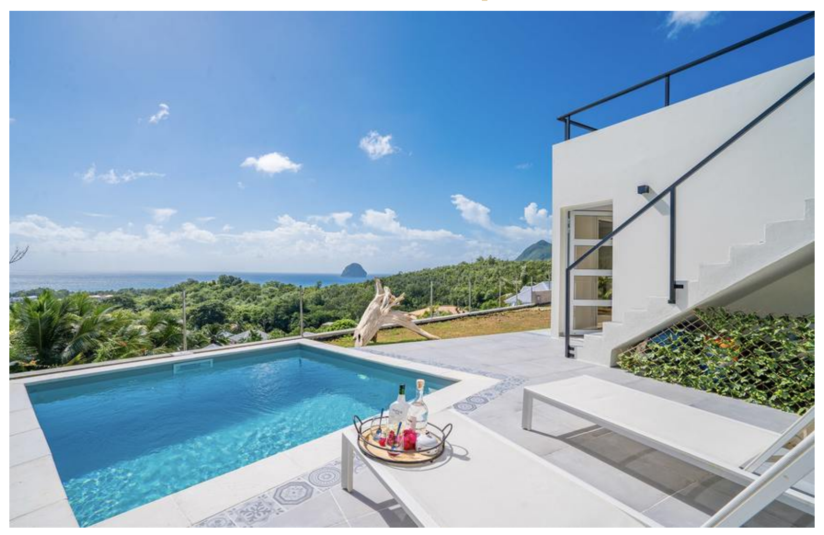
From 112.85 € / night - 0 bedroom(s) - 1 bathroom(s)