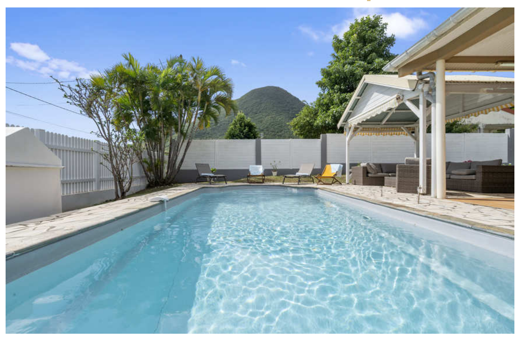
From 200.0 € / night - 3 bedroom(s) - 2 bathroom(s)