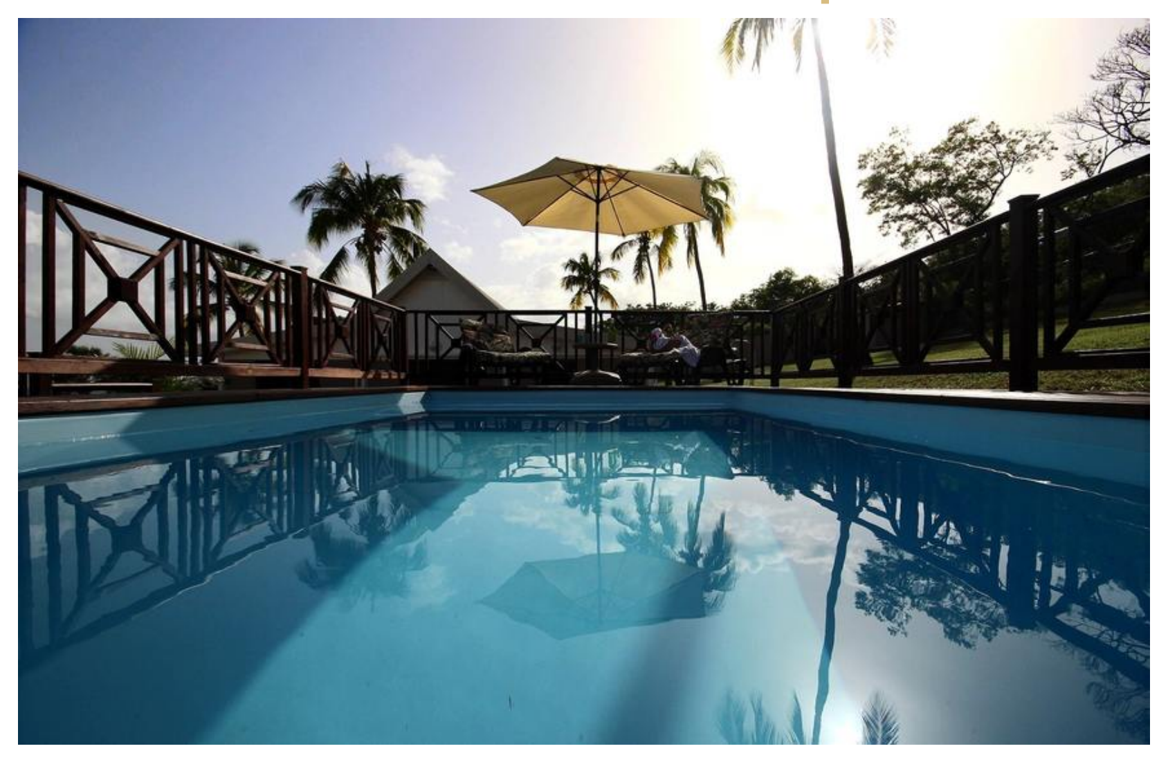
From 457.14 € / night - 4 bedroom(s) - 3 bathroom(s)