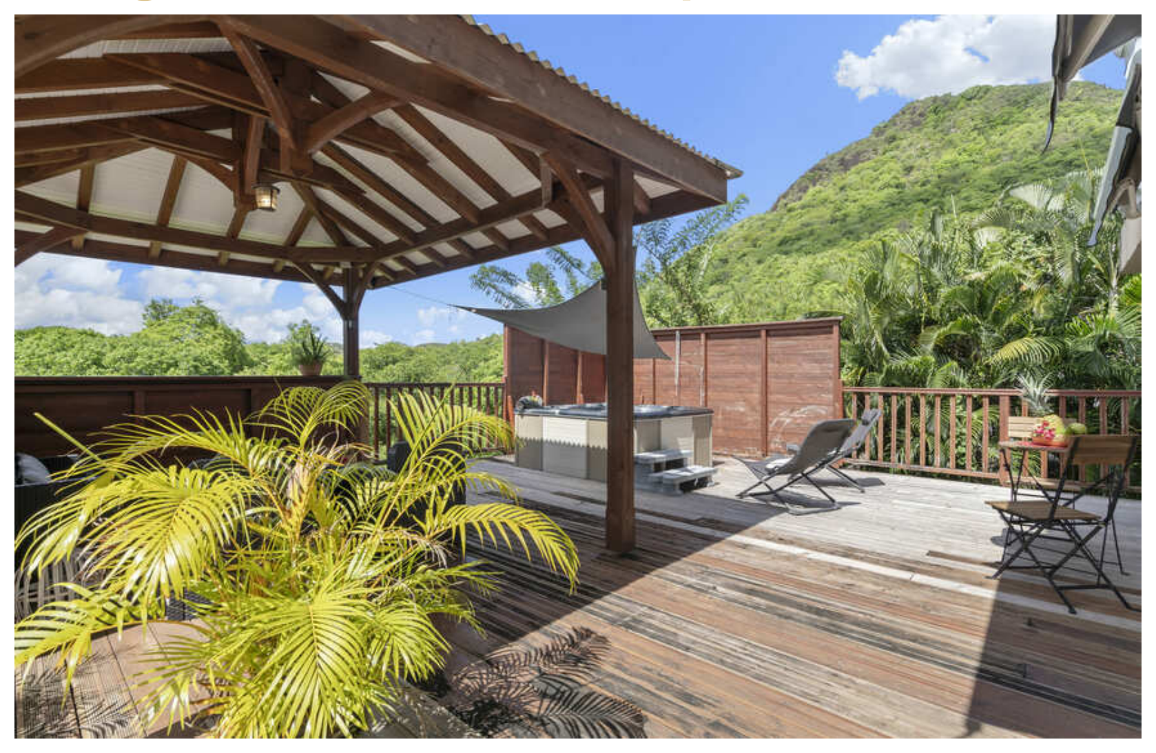
From 70.0 € / night - 1 bedroom(s) - 1 bathroom(s)