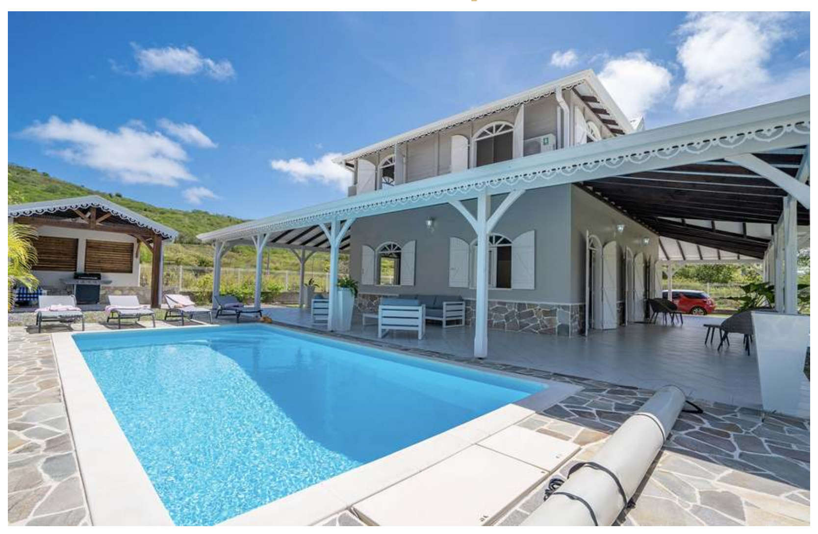
From 221.43 € / night - 4 bedroom(s) - 2 bathroom(s)