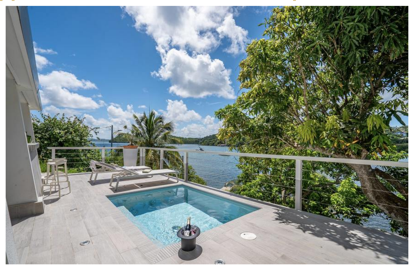
From 105.0 € / night - 1 bedroom(s) - 1 bathroom(s)