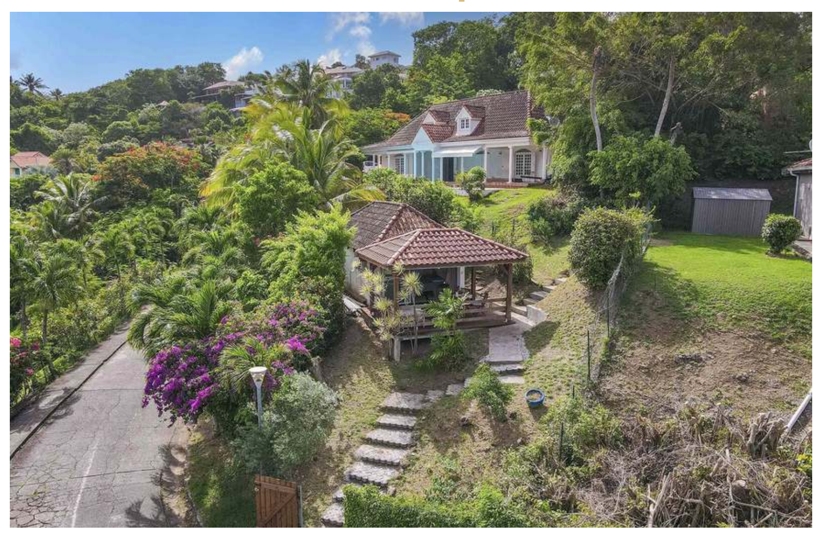
From 70.0 € / night - 0 bedroom(s) - 1 bathroom(s)