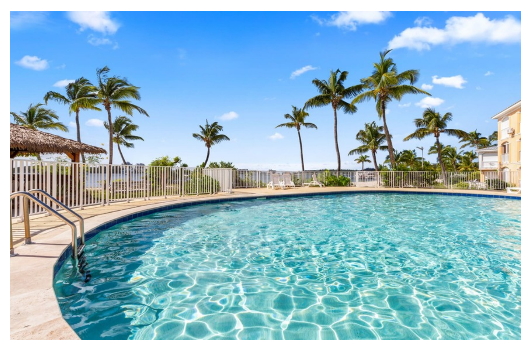
From 90.0 $ / night - 1 bedroom(s) - 1 bathroom(s)